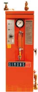
VS 300 SERIES 10 TO 80 KILOWATTS