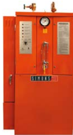
VS 610 SERIES 80 TO 480 KILOWATTS